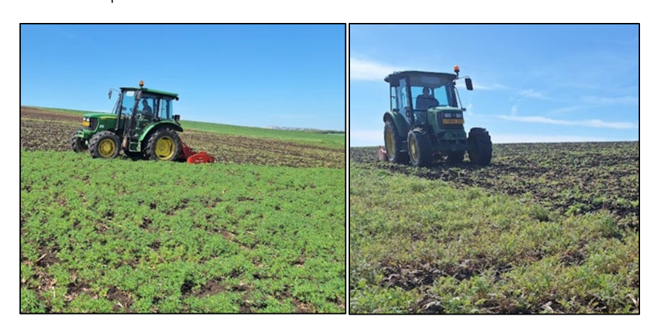
Figure 2. Using cover crops as green manures before maize sowing (Lupine and Phacelia)

The harvest of the maize experiment was gathered manually, by meeting the methodological rules of the experimental technique.