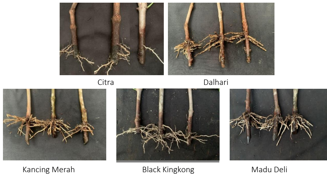
Figure 2. Description of the root condition of the water apple cultivars Citra, Dalhari, Kancing Merah, Black Kingkong, and Madu Deli

All cultivars did not show any significant difference in the root length of water apple cuttings. The application of growth regulators increased the root length of water apple cuttings starting from the 4 until 8 WAP. The application of 4000 ppm IBA resulted in the highest root length, but was not significantly different from the use of 30% Aloe vera (Table 4).